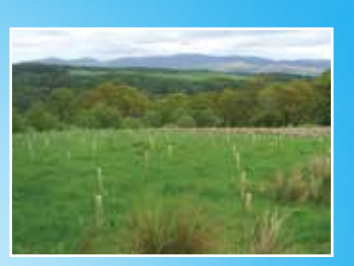
Crairieknowe, Auchenhessnane and Holm of Drumlanria.

'For us, the income stream has enabled developments and improvements to the estate's natural assets, and the projects sustain local employment.'